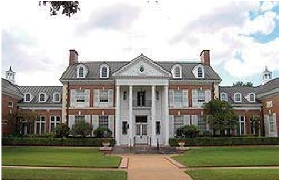
TFWC Headquarters 2312 San Gabriel; Austin, Texas 78705-5014