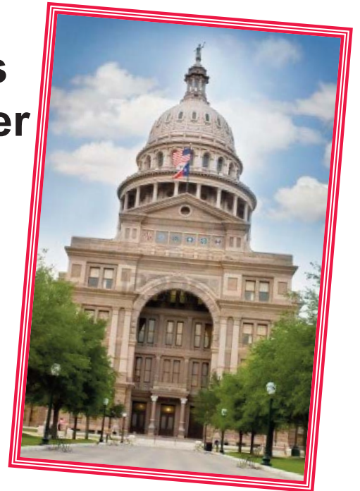
Texas Capital Building (Right) Wildflower Center (Left)

No first trip to Austin, Texas, would not be complete without a tour of the state capital . Attendees will get just such an opportunity all arranged by TFWC.