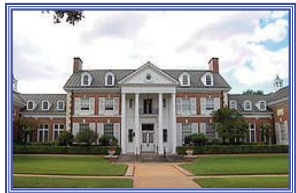
2312 San Gabriel, TFWC Headquarters