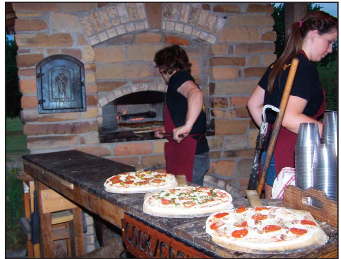
The free-standing brick oven at Ancient Ovens provides the old world touch to the meals prepared there. Here, the main course is being prepared for guests.