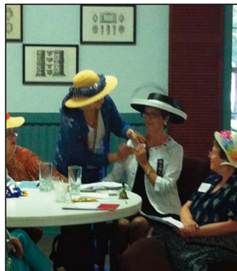
San Gabriel Woman's Club members present their skit, "Crystal's Belles of Protocol."